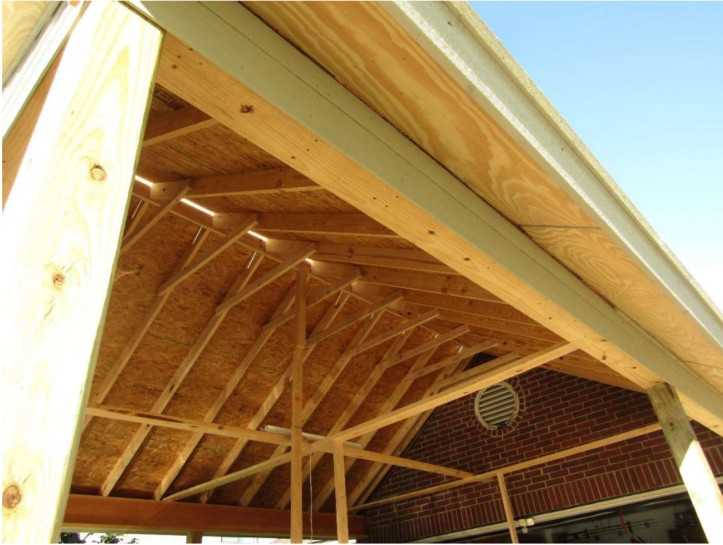
Carport Attached to Existing Structure