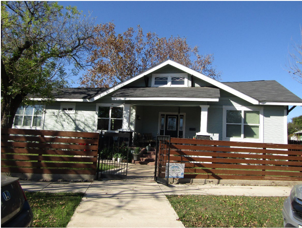
Front Yard Fence