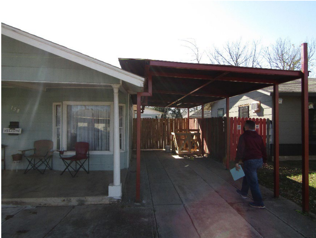
Subject Property Carport