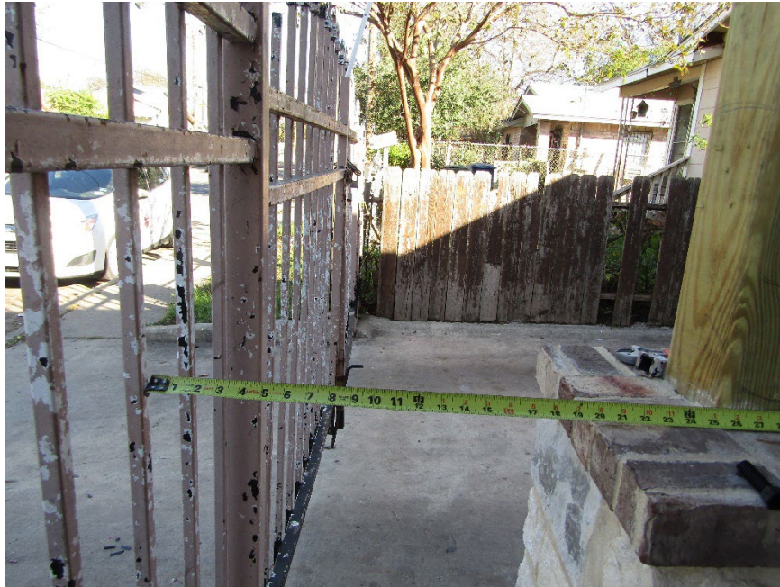
Side setback measurement