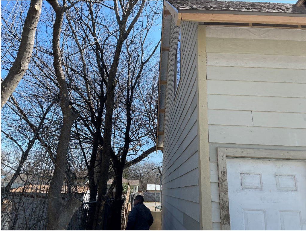
5' 5" from Rear of Property Line