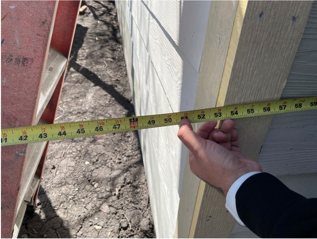
Overhang on Side