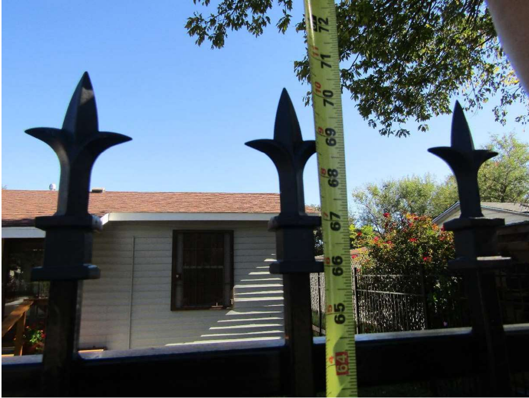
Measurement from fence to curb