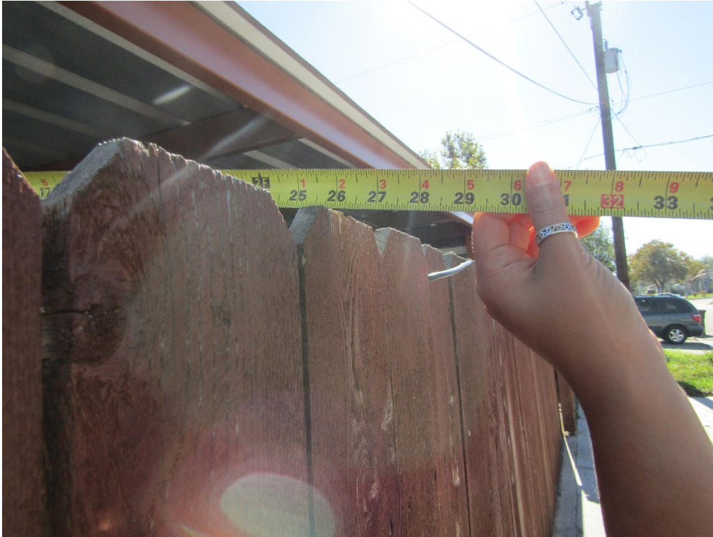
Gate 14' 5" away from curb