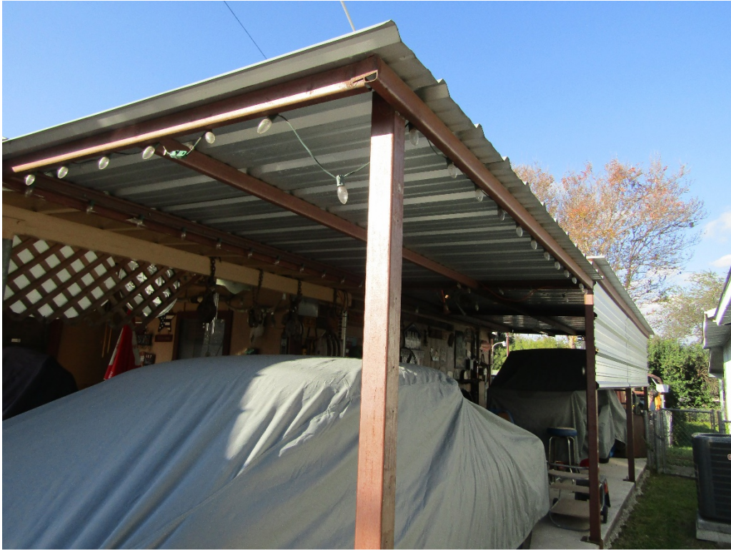
Side of Carport