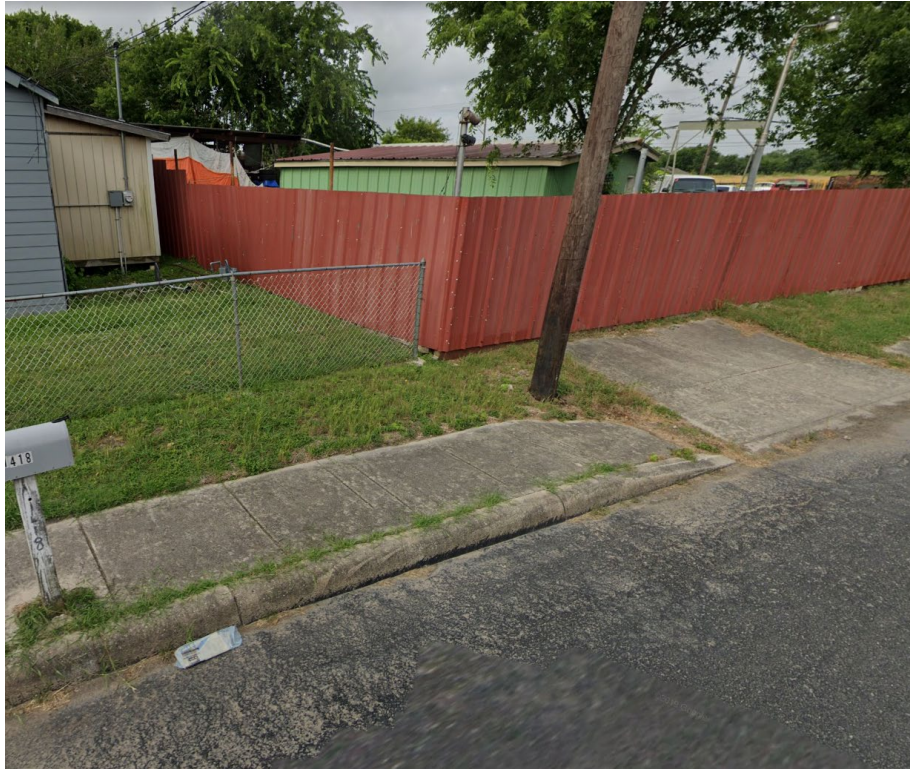
Right Side of Property