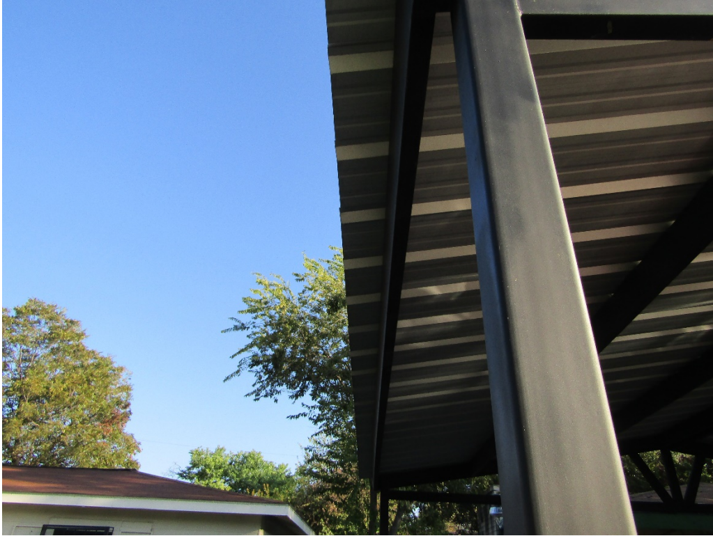
1' 6" from Side Property Line