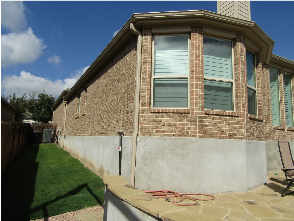
Rear of a Property