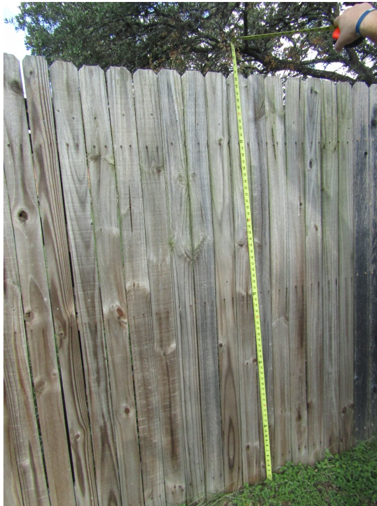
6' in Height