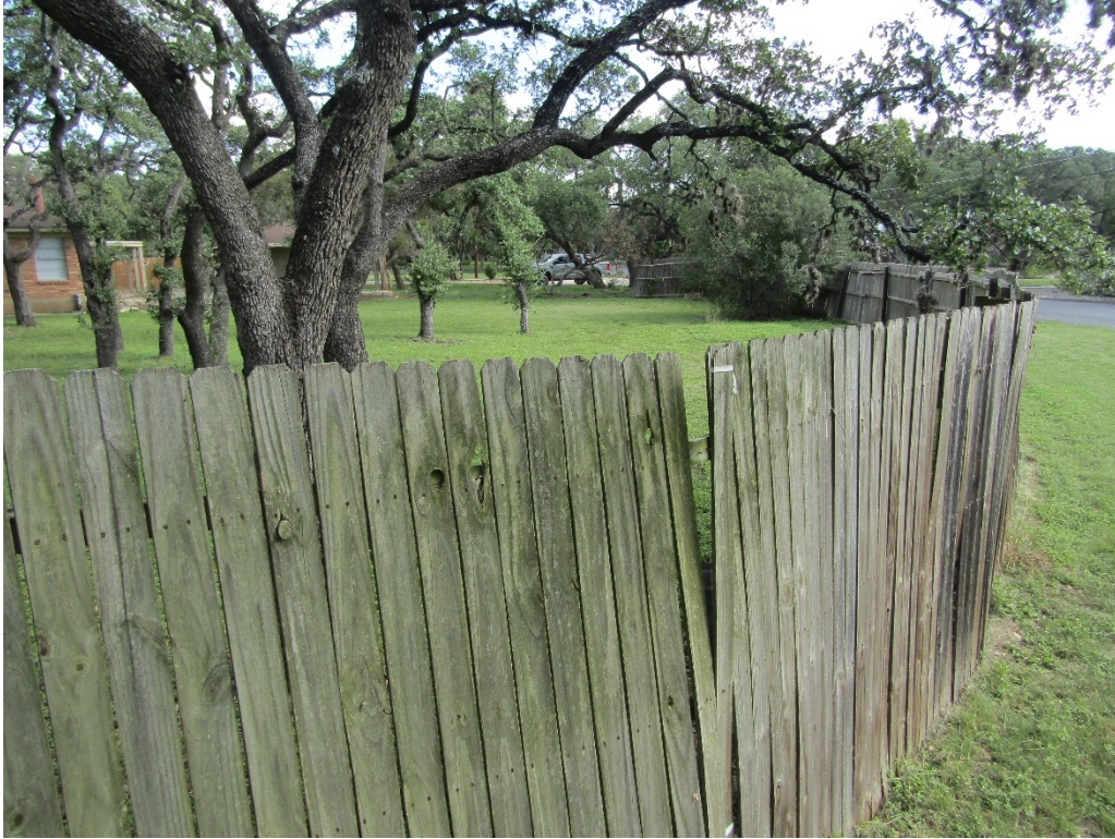
Change in Grade