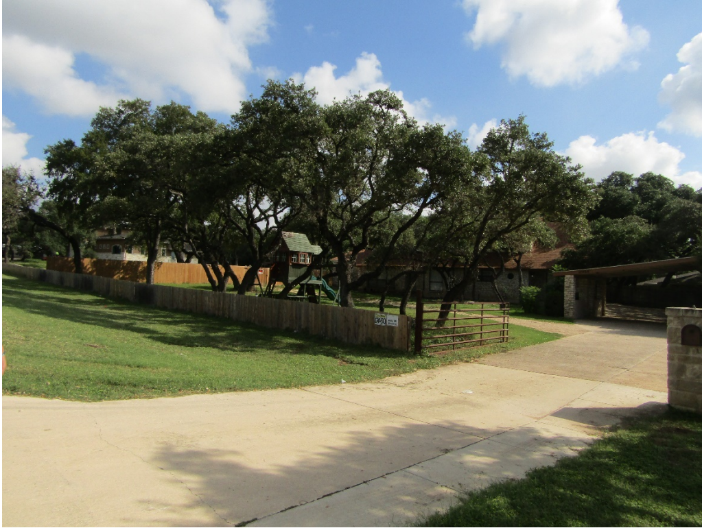
Change in Grade