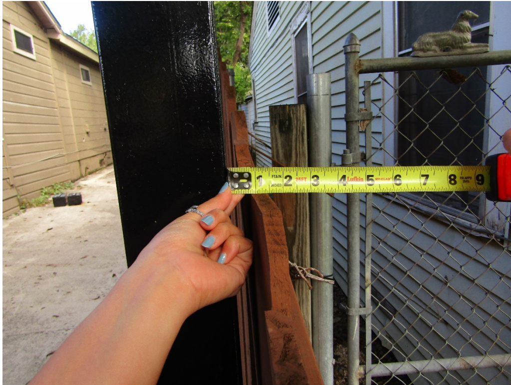
Front Yard Fence along eastern property line