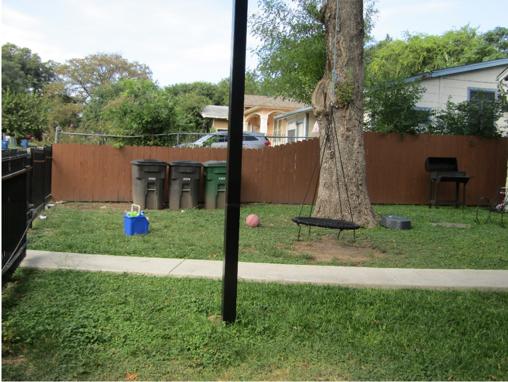
6' Tall Portion of Front Yard Fence exceeding façade of home by 18'