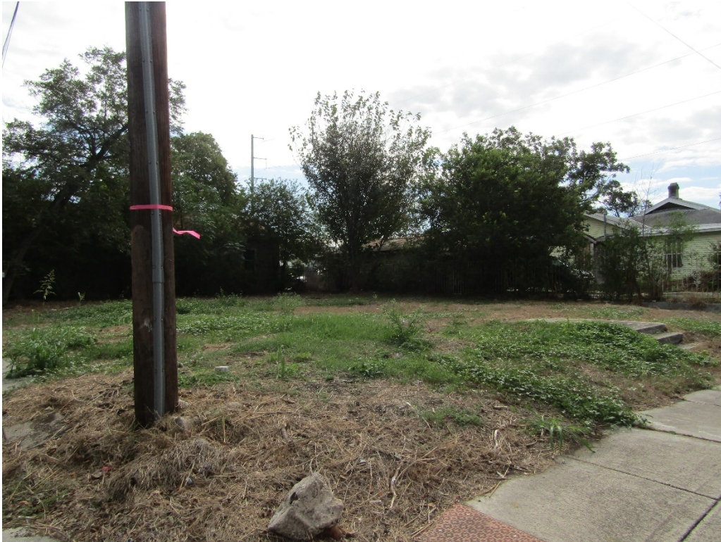
Existing Approach on Property