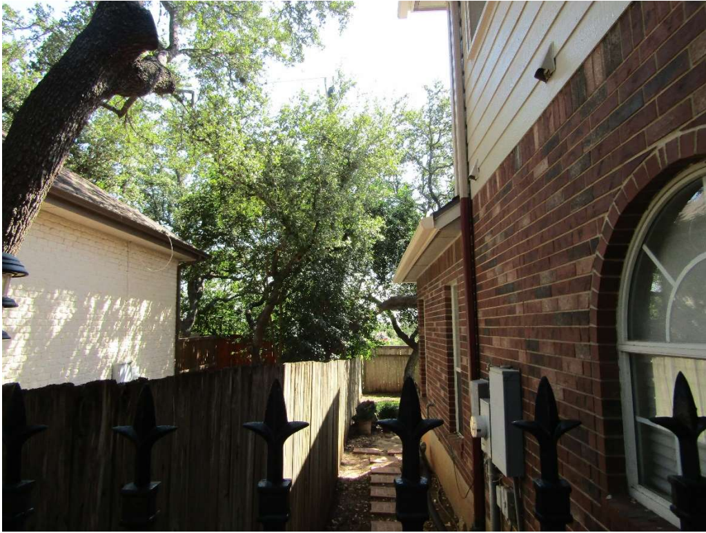
6' Existing Fence