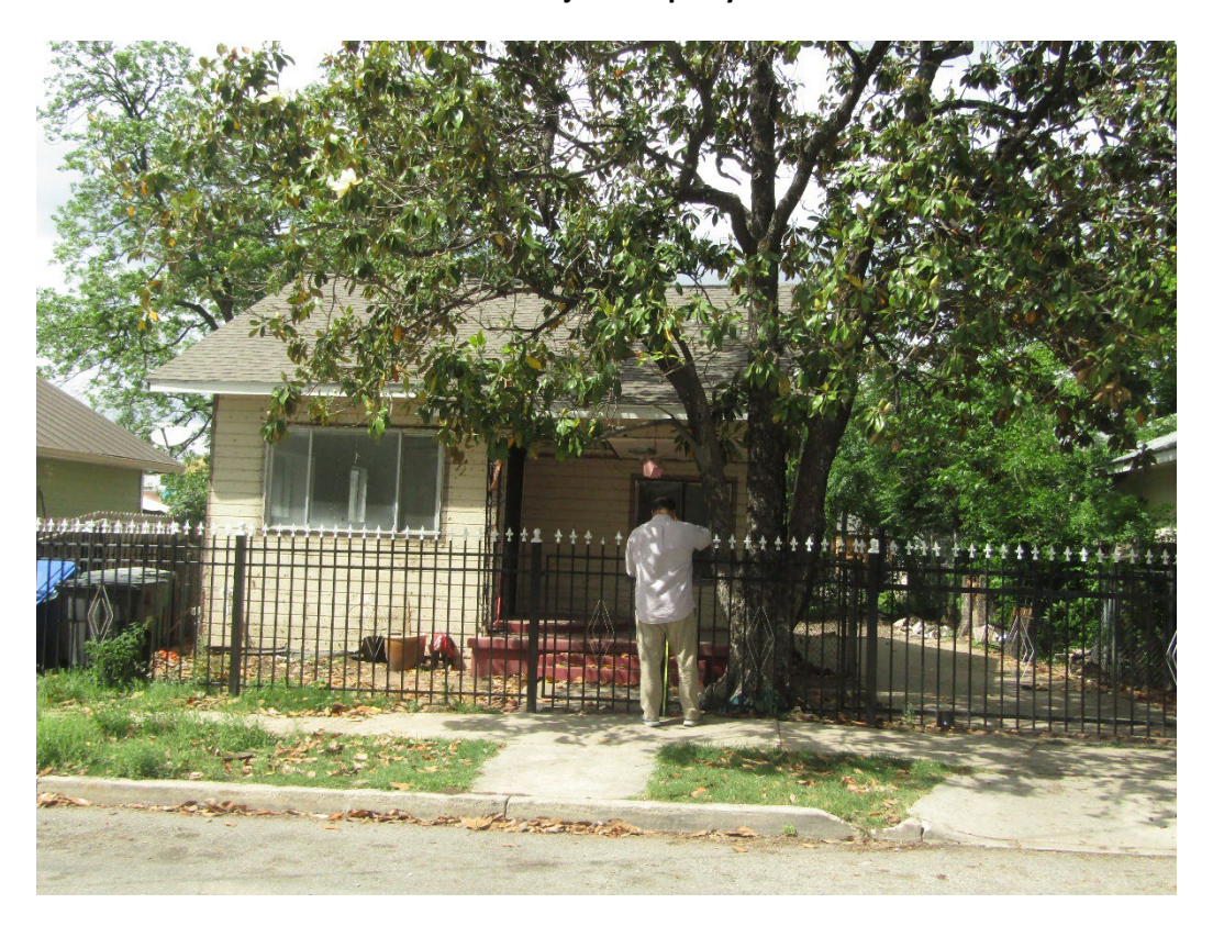
Clear Vision Measurement