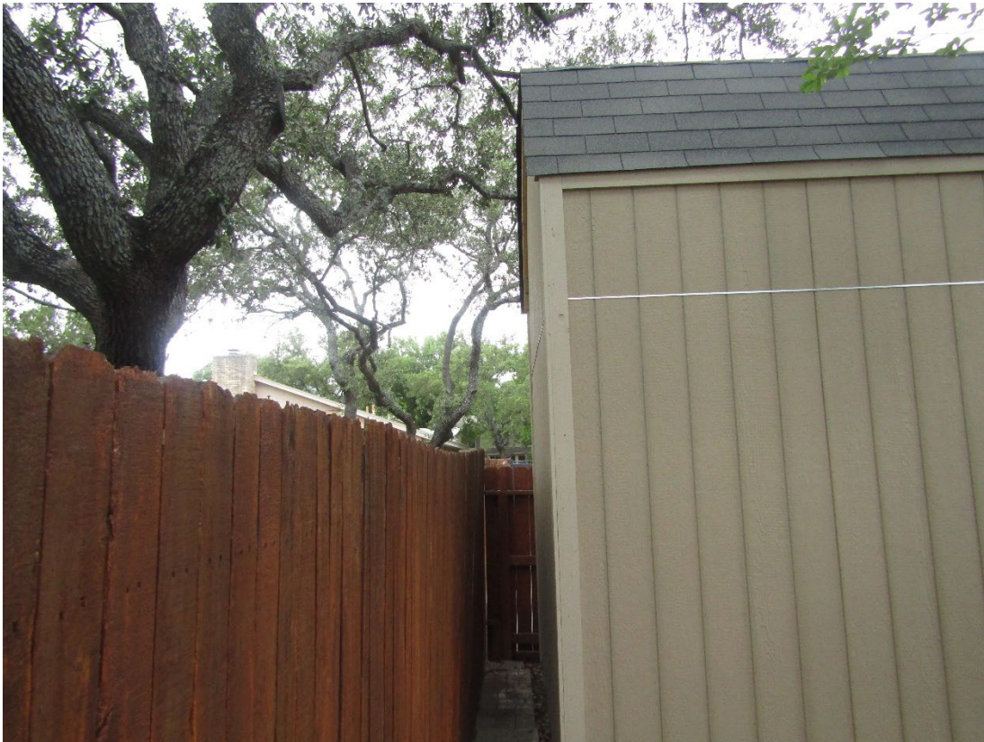
Side Setback Measurement