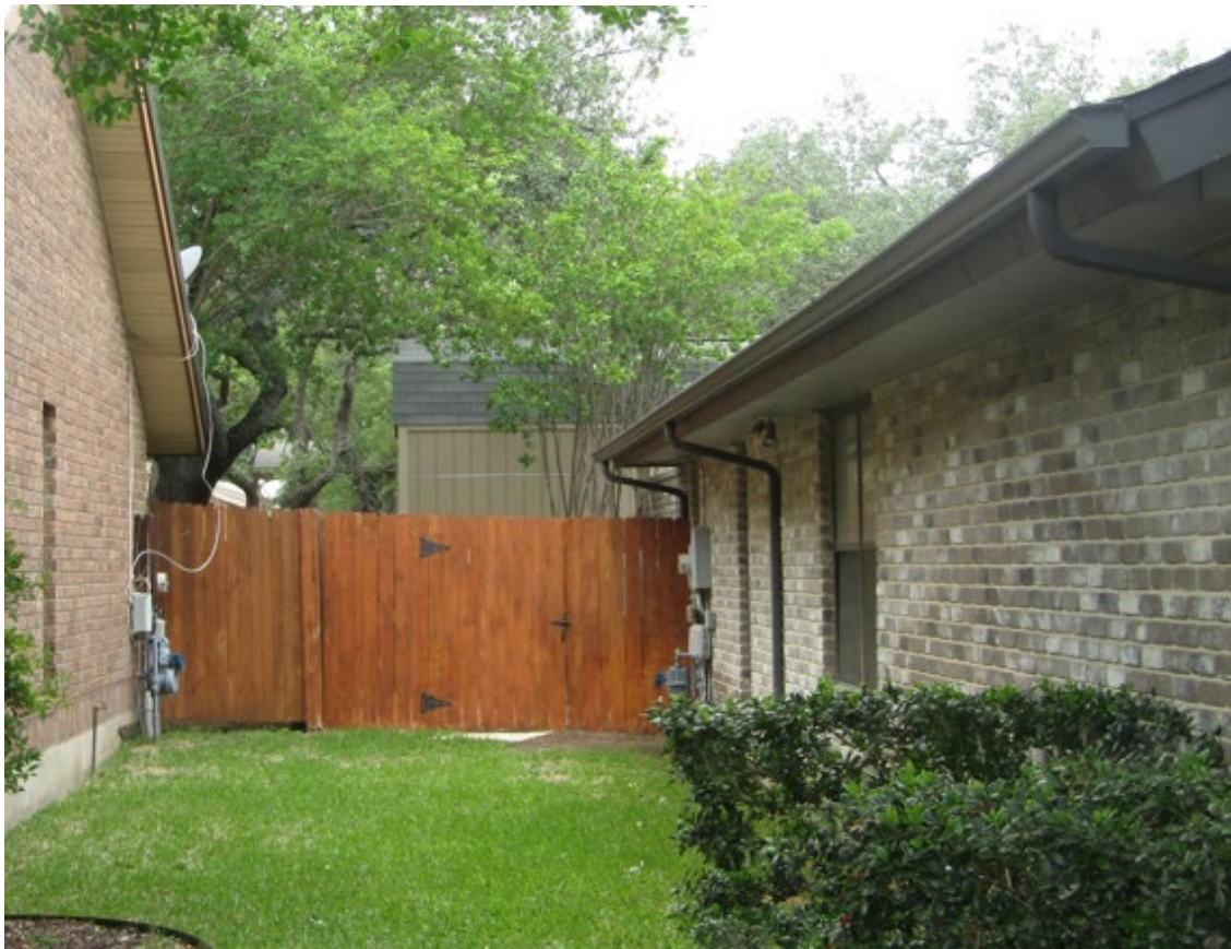
24' Paved Alleyway in the Rear with Other Accessory Structures in the Immediate Area