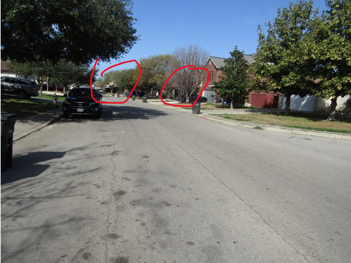
Carport 2 Doors Down