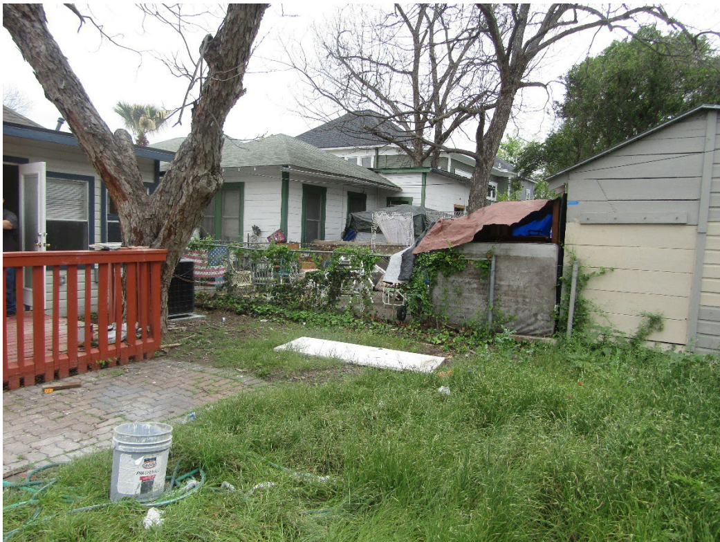
Accessory Structure in the Rear Yard