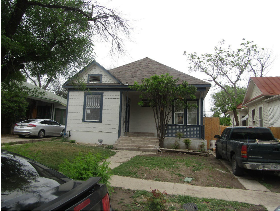
Location of Proposed 8' Fence with Structure 2'-4" From the Side Property Line