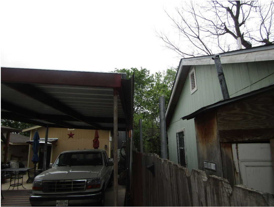
12' Rear Yard Fence with Corrugated Metal Fence Material