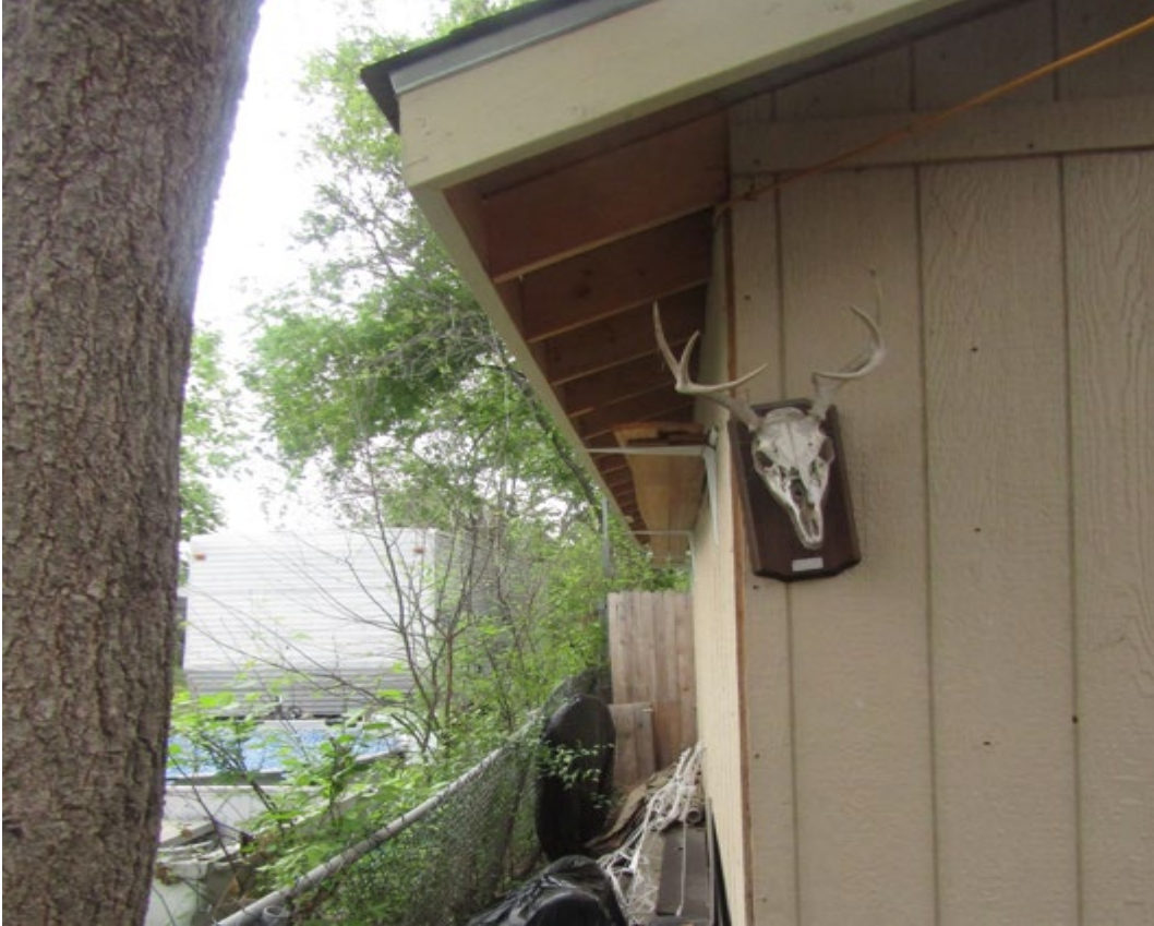
Rear Yard Setback of 3'