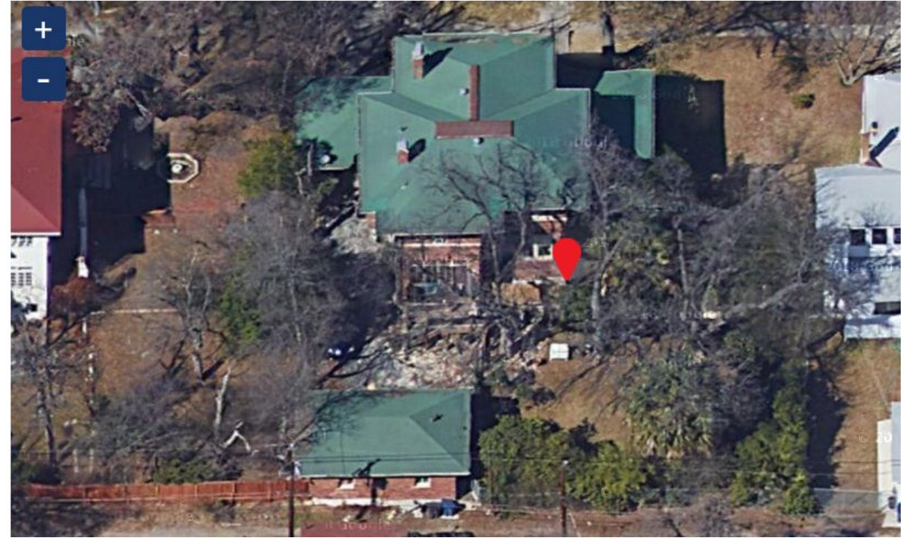
Screen grab from Remax.com showing garage before demolition. Accessed by staff 21 June 2019.