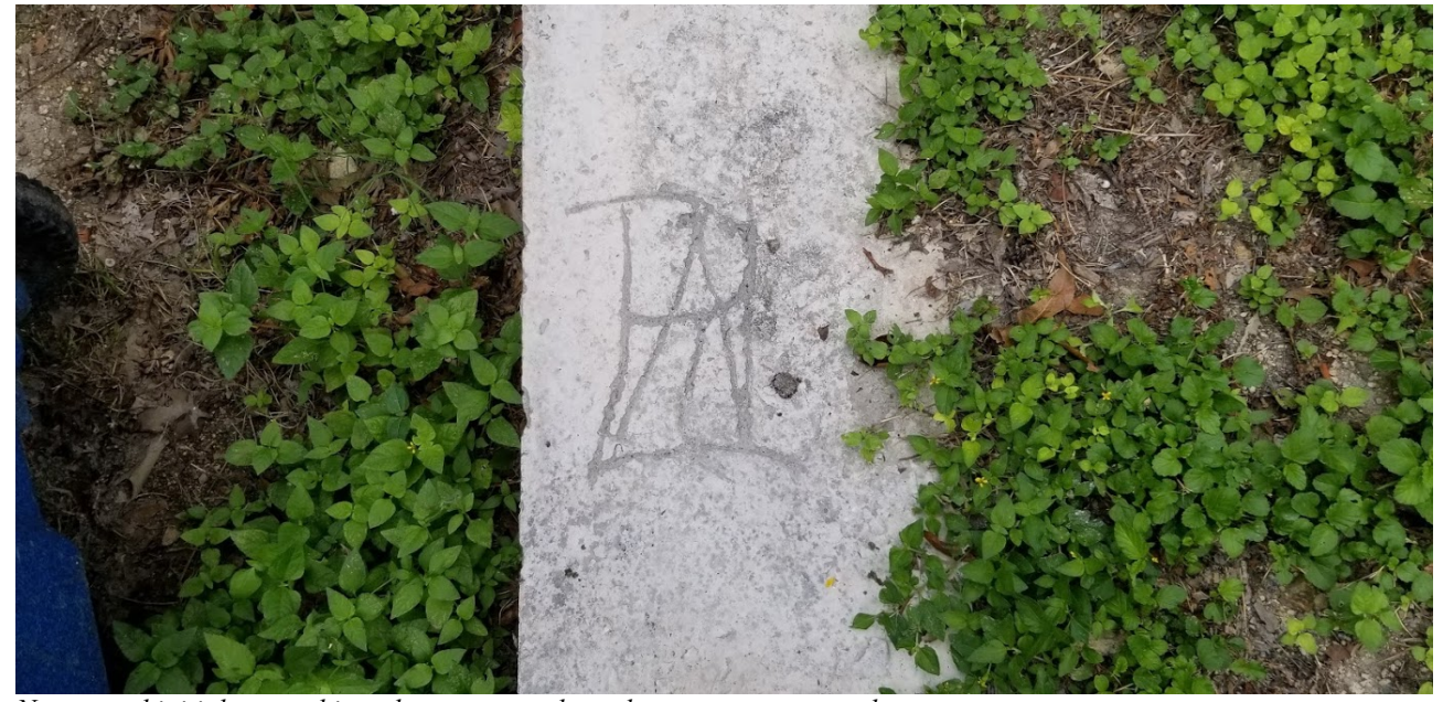
Names and initials carved into the concrete where the garage once stood.