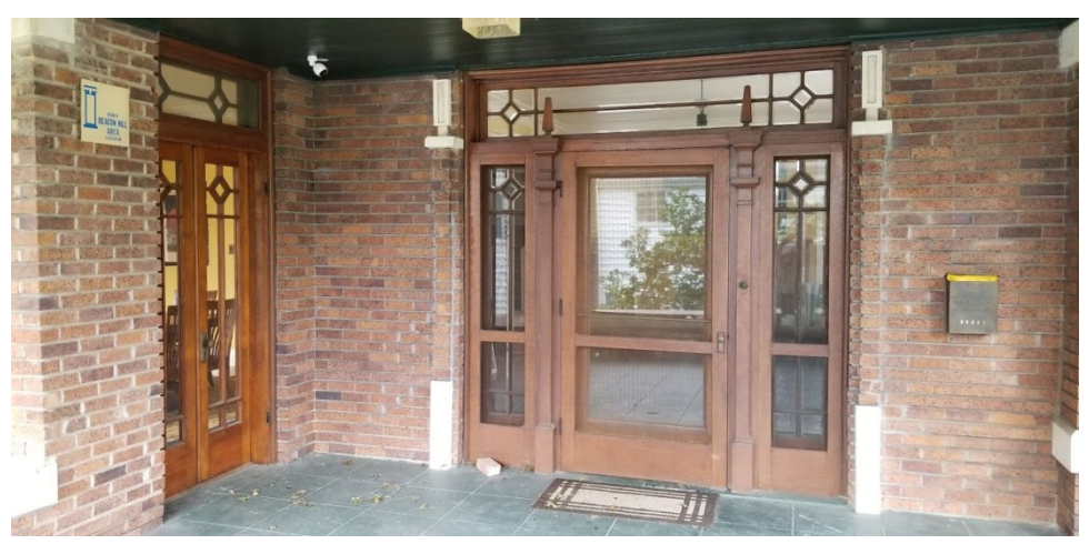
Main entrance, from east porch.

1901 S. ALAMO ST, SAN ANTONIO, TEXAS 78204