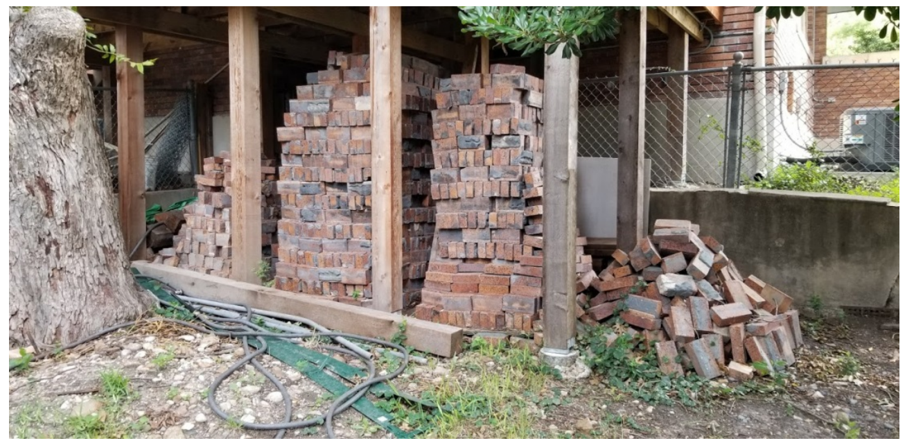
Bricks from the garage were salvaged and are stored under the home's rear deck.