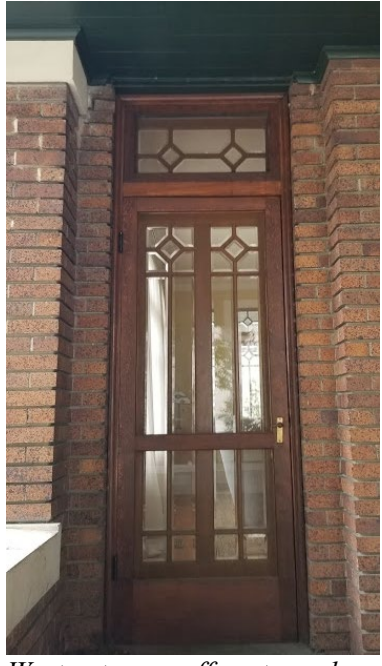
West entrance off porte cochere.