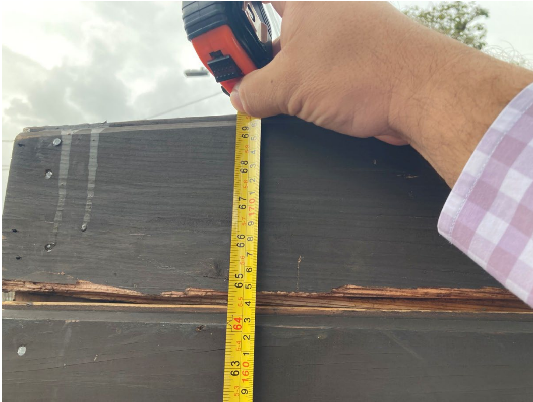
Clear Vision Measurement