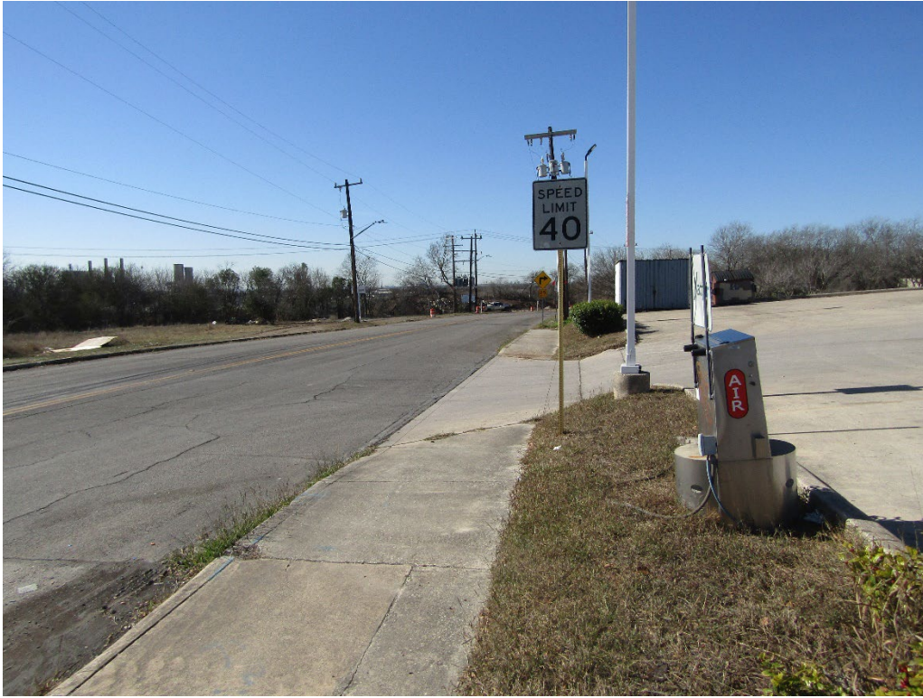
View of intersection at Thousand Oaks and Schertz Drive