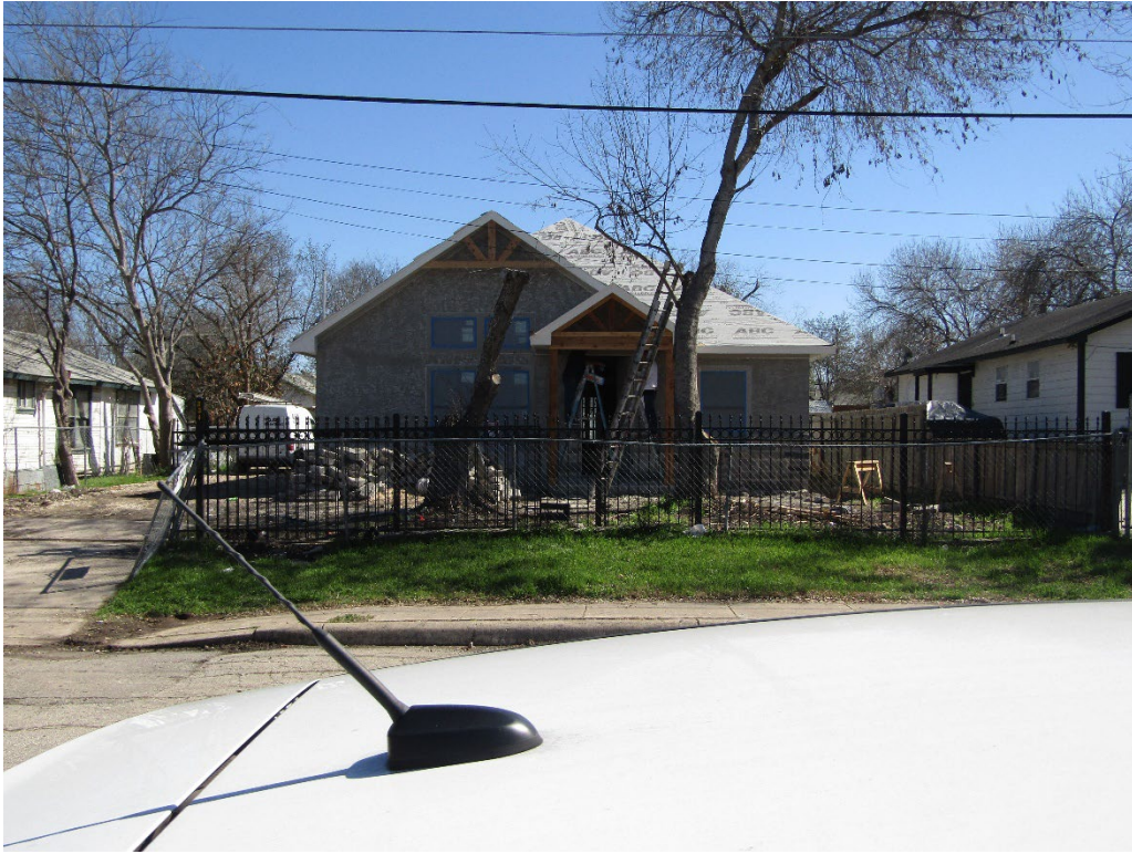
Fence on side of property