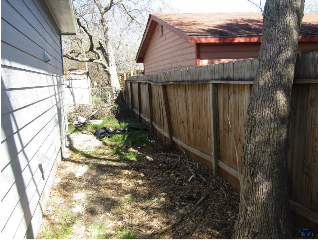
View of fence from front of property.