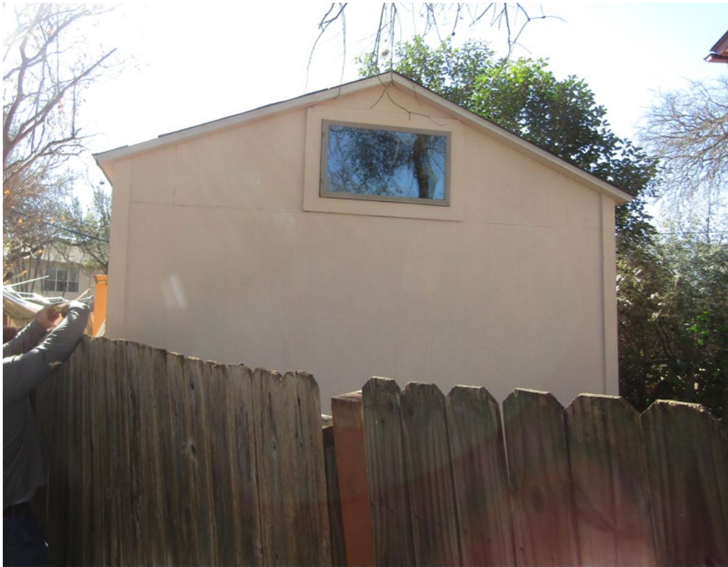
Side Setback Measurement