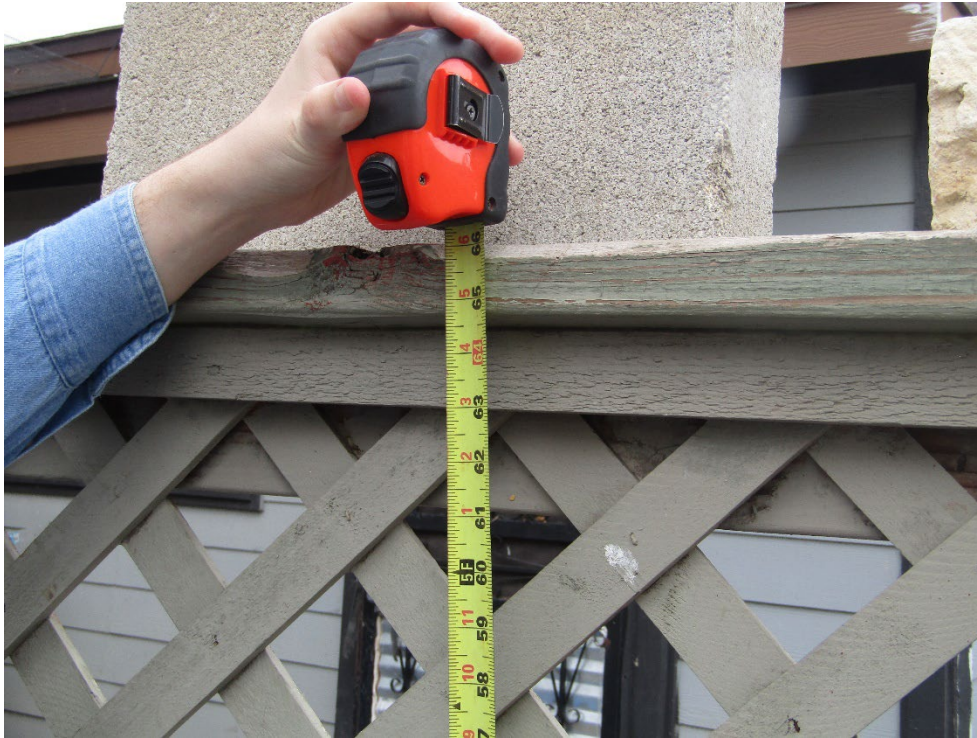
Corner Curb Clear Vision Measurement