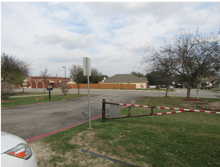
Subject Property's Parking Lot 3