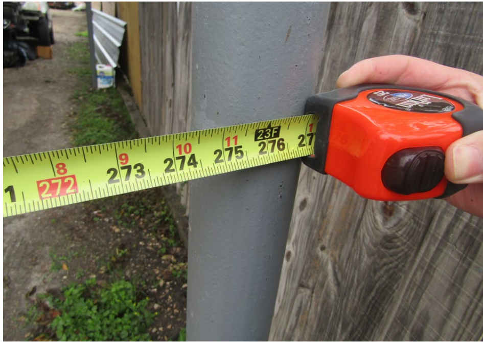
Fence Height at its Highest Point in the Front Yard