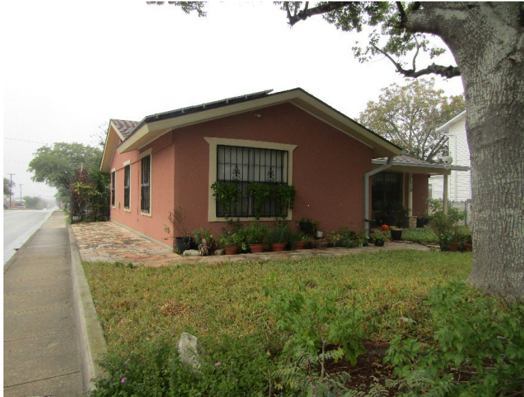
Built Free Standing Deck