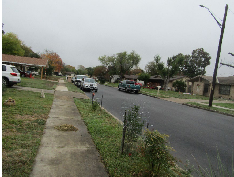
Similar Carport in Area 2