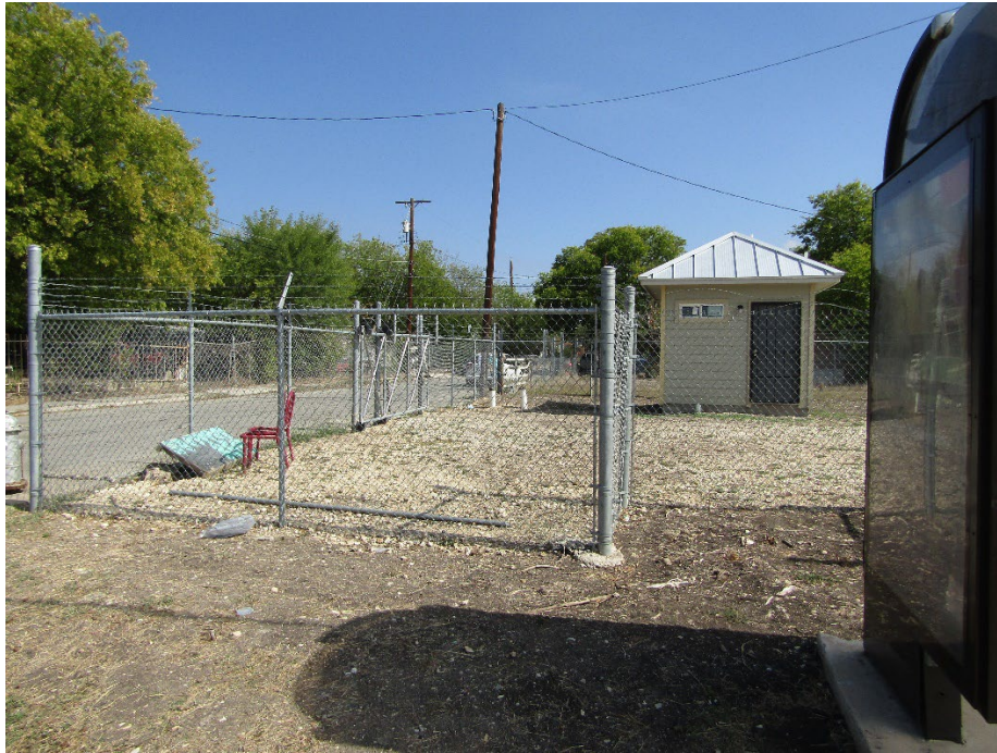
Side property line and adjacent property