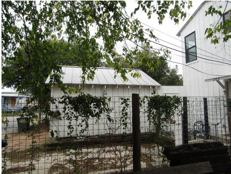
Alternate View of Rear of Property