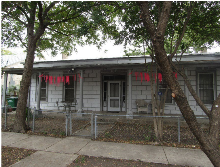
Side of Property