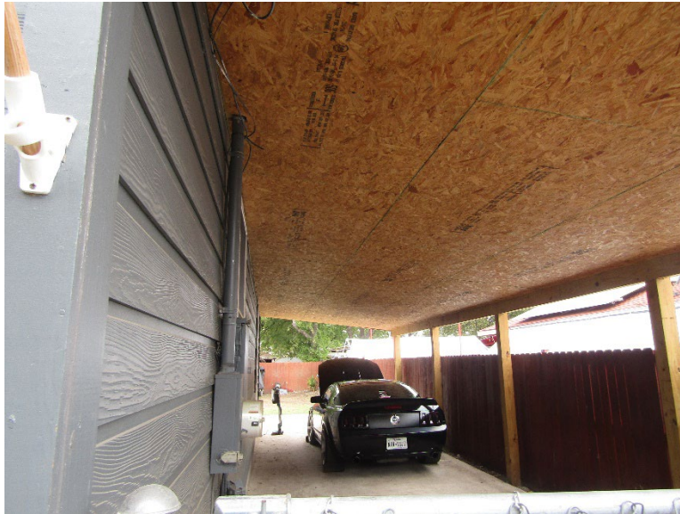
Attached portion to the home