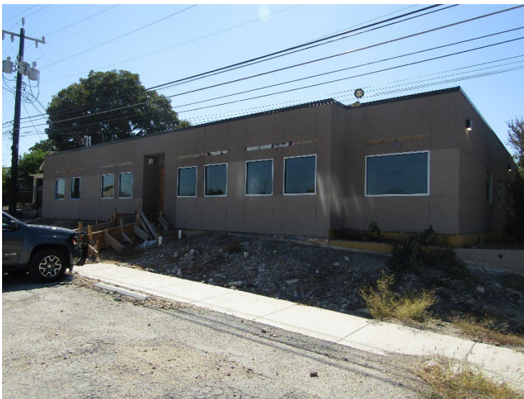
Portion of Subject Property Rear Yard