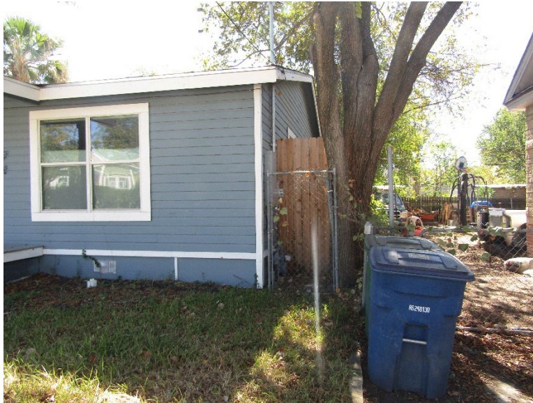
Proposed Location of Carport