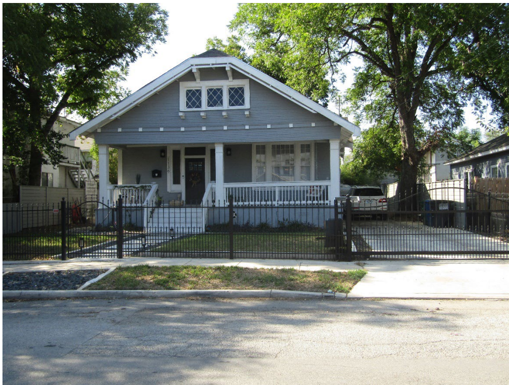
Fence in front of property

Subject Property: 1136 West French Place