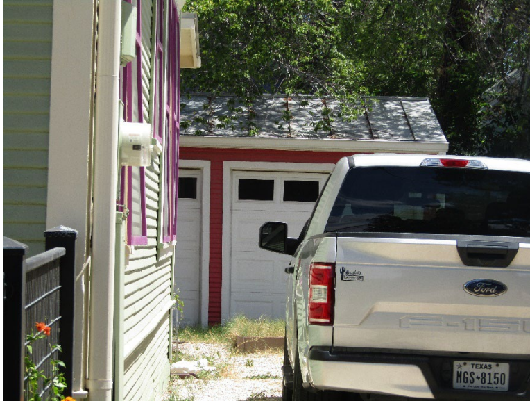
Proposed Development Site