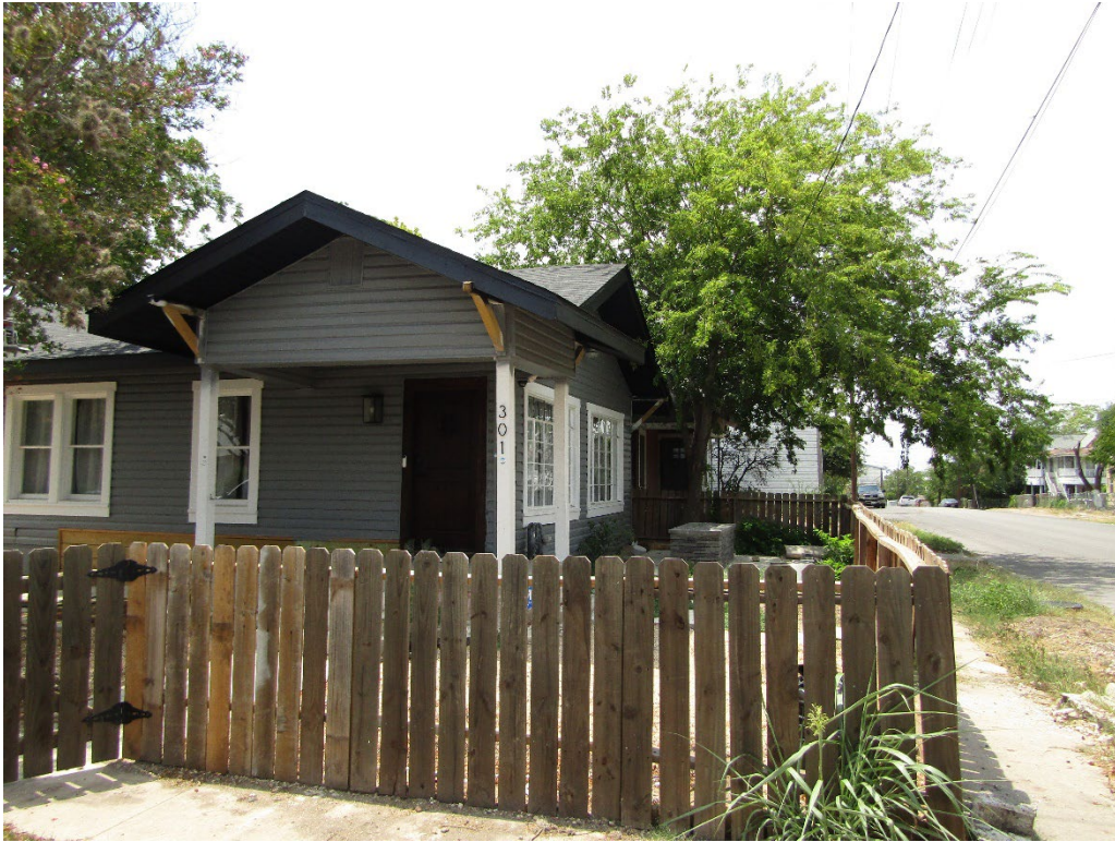
Detached Accessory Structure