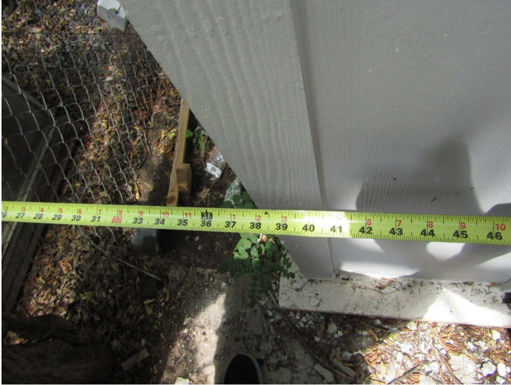
Side setback from property line