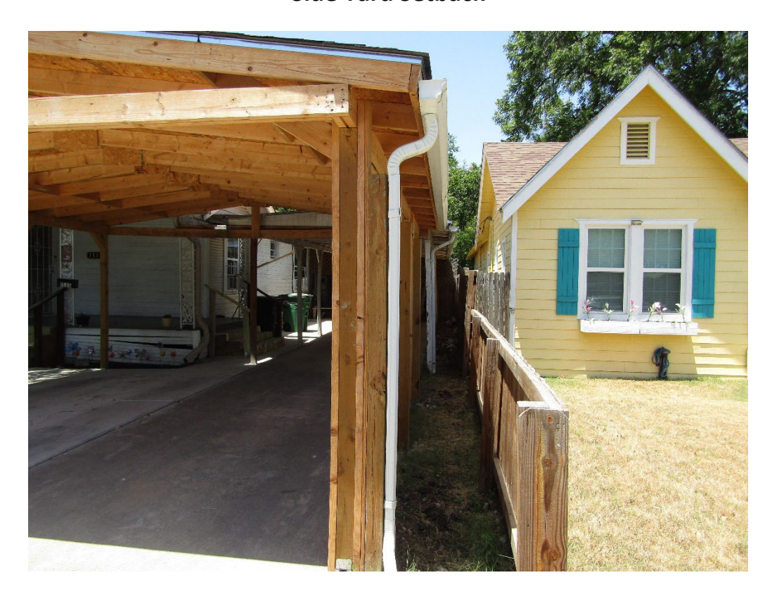
Side Yard Setback