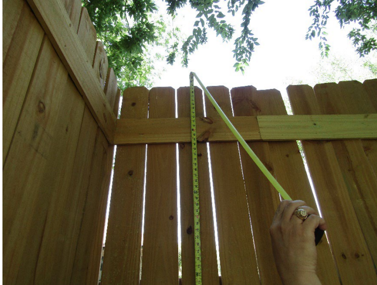
View of Yard from Fence Side