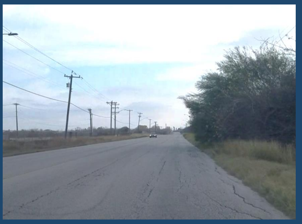
Southbound on S. Presa south of Story Lane