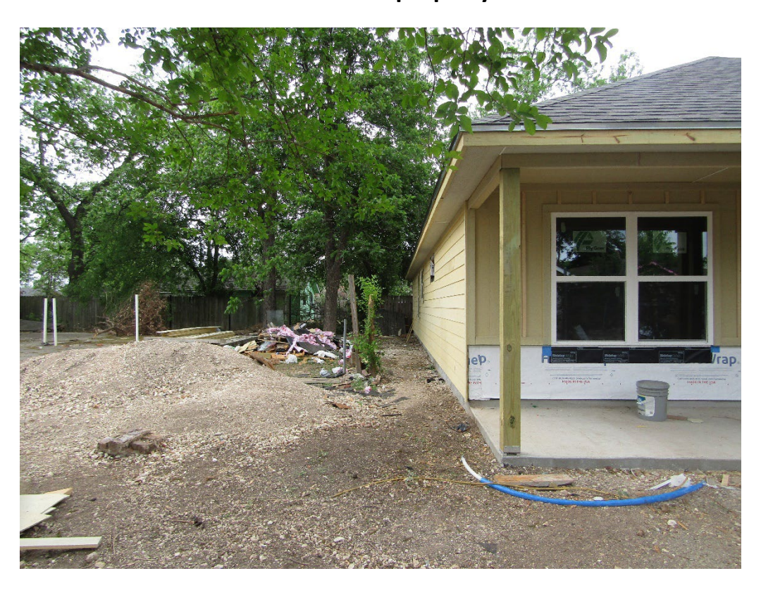
Side setback property line