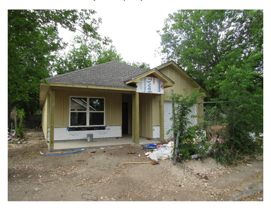
Garage entry in front of property