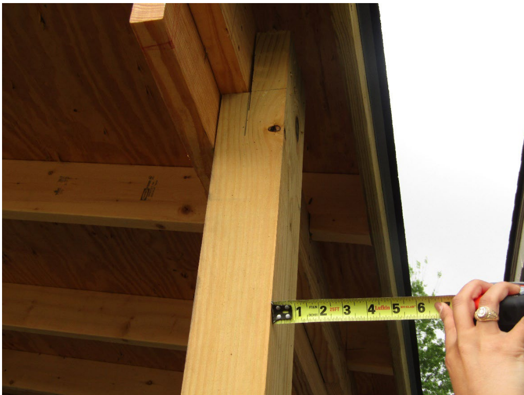
Side setback from property line