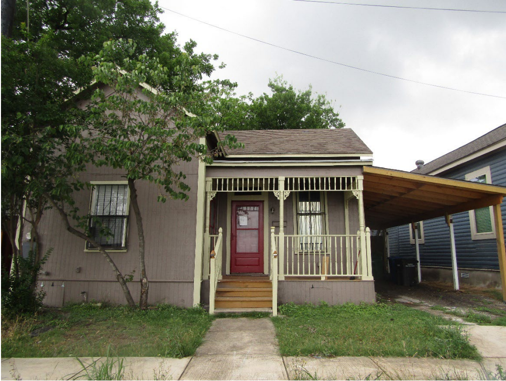
Carport for property