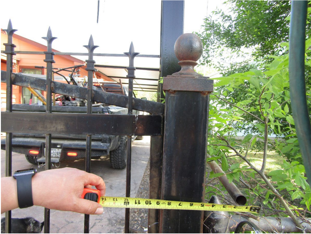
Clear Vision Measurement