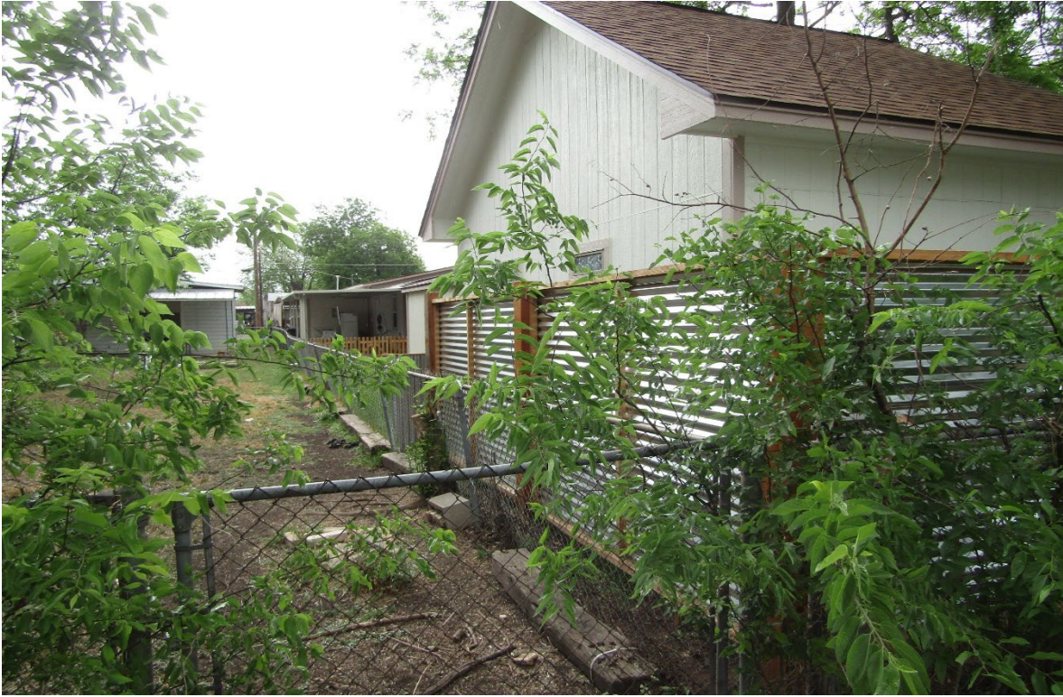
Rear of Subject Property