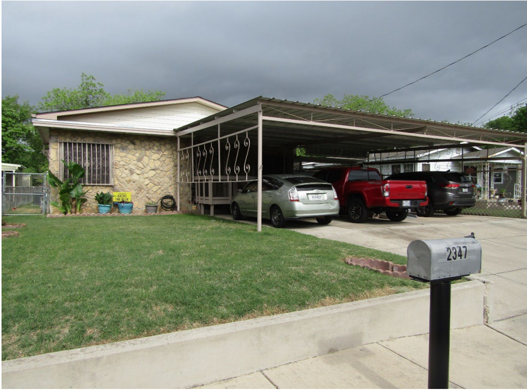
Rear of Subject Property