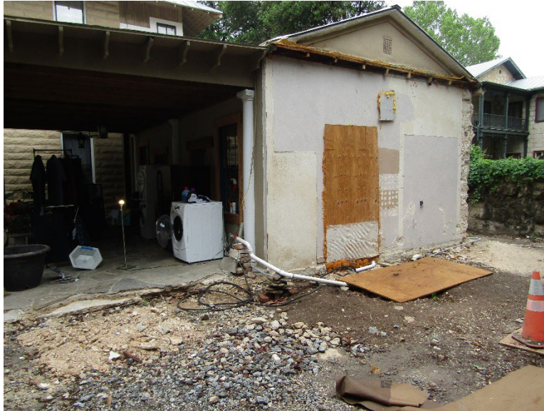
Proposed Development Site