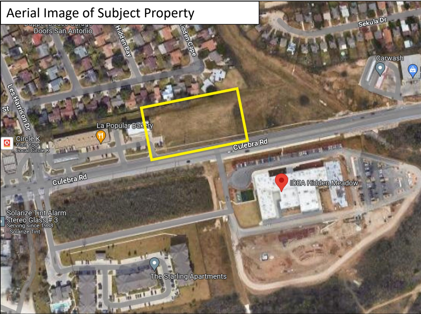
Aerial Image of Subject Property