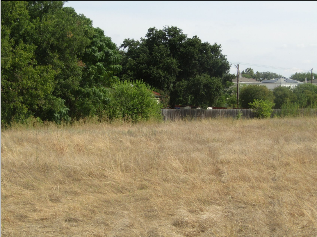
Views of subject property