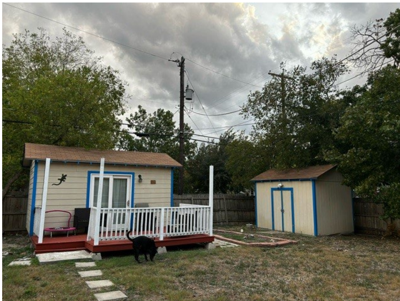
5. 1302 Hicks Avenue – Casita & storage unit (North)