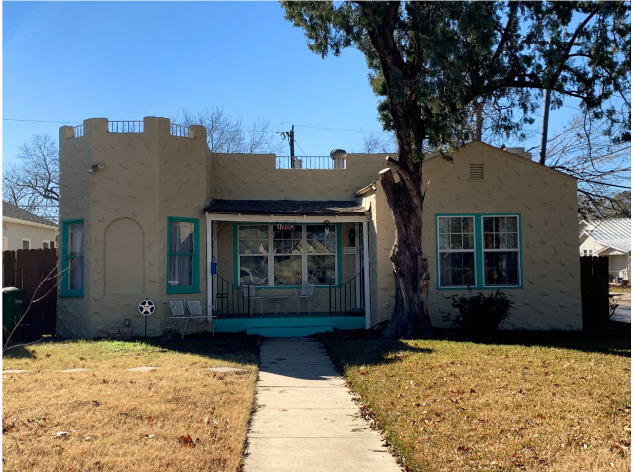
1. 1302 Hicks Avenue – Front façade

100 W. HOUSTON ST., SAN ANTONIO, TEXAS 78205