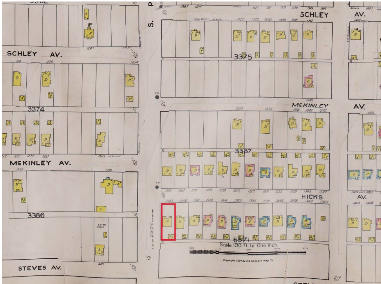
6. Sanborn Map (1931), Vol. 3, Sheet 319

100 W. HOUSTON ST., SAN ANTONIO, TEXAS 78205