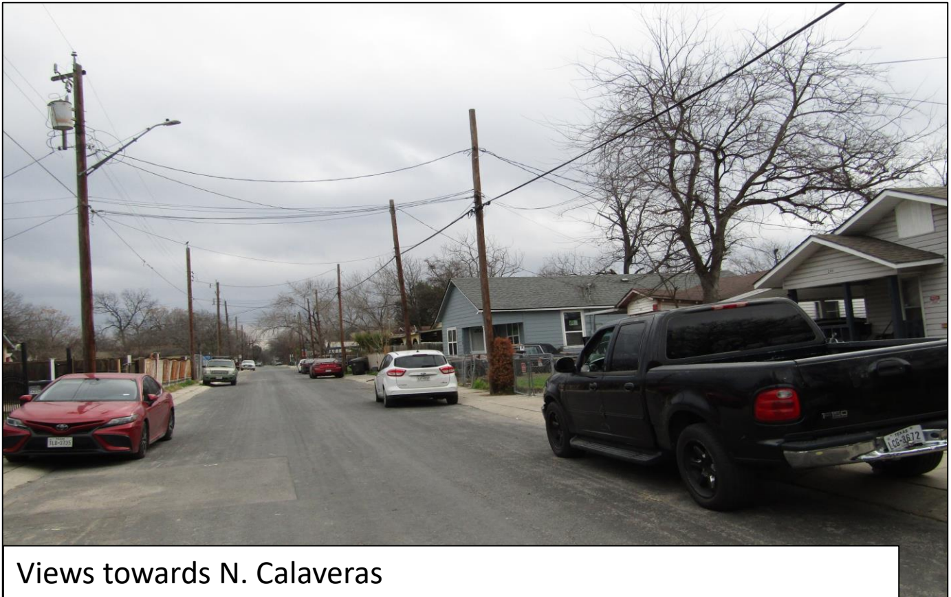
Views towards N. Calaveras