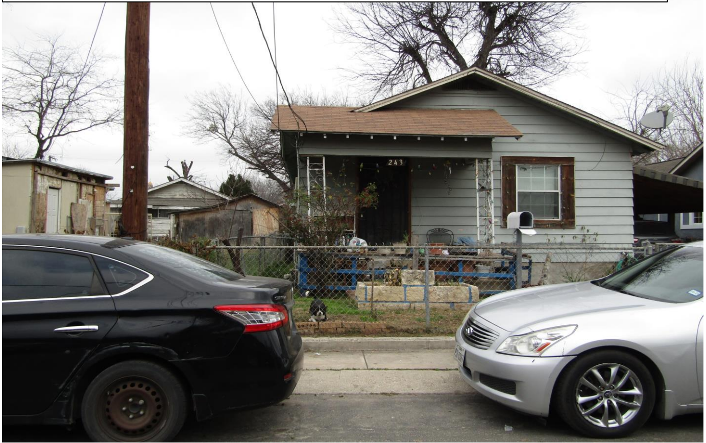
View of property directly across the street