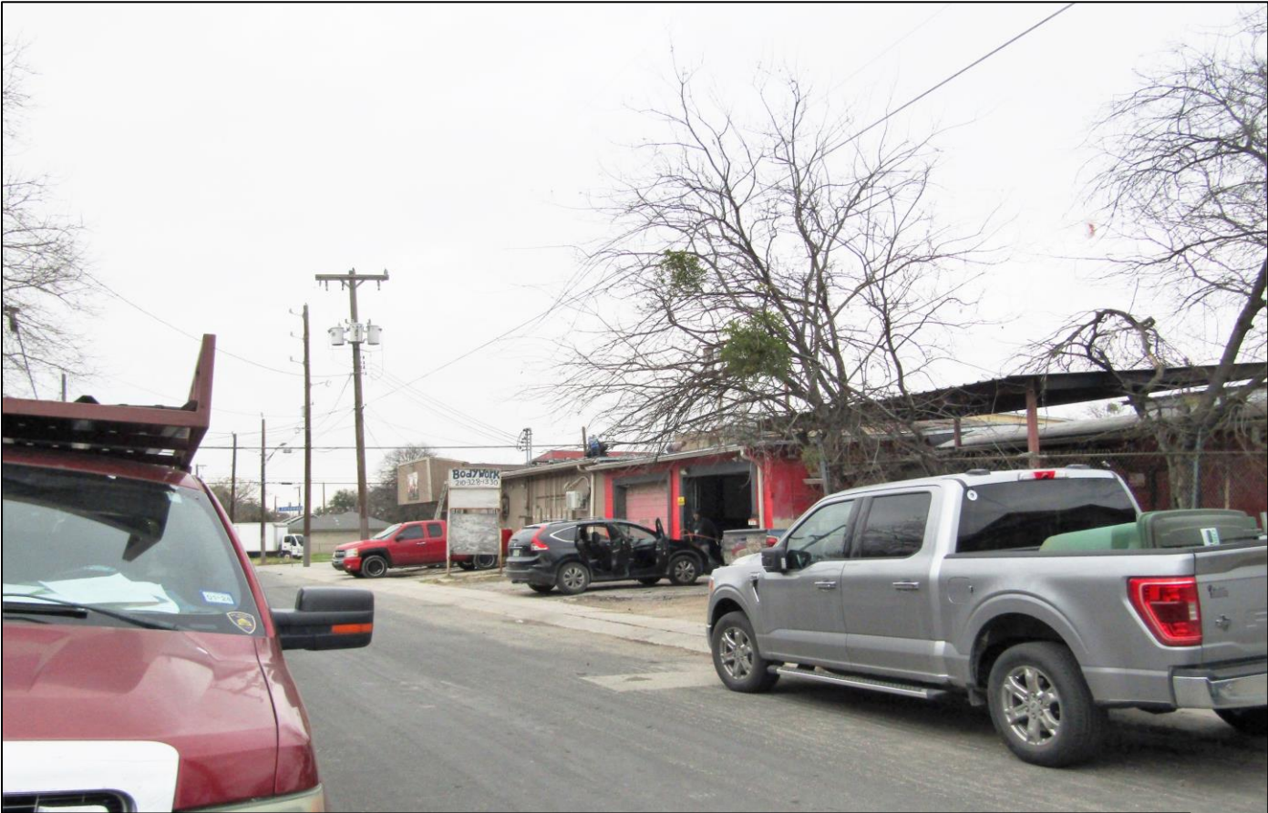
View towards N. Zaramora Street