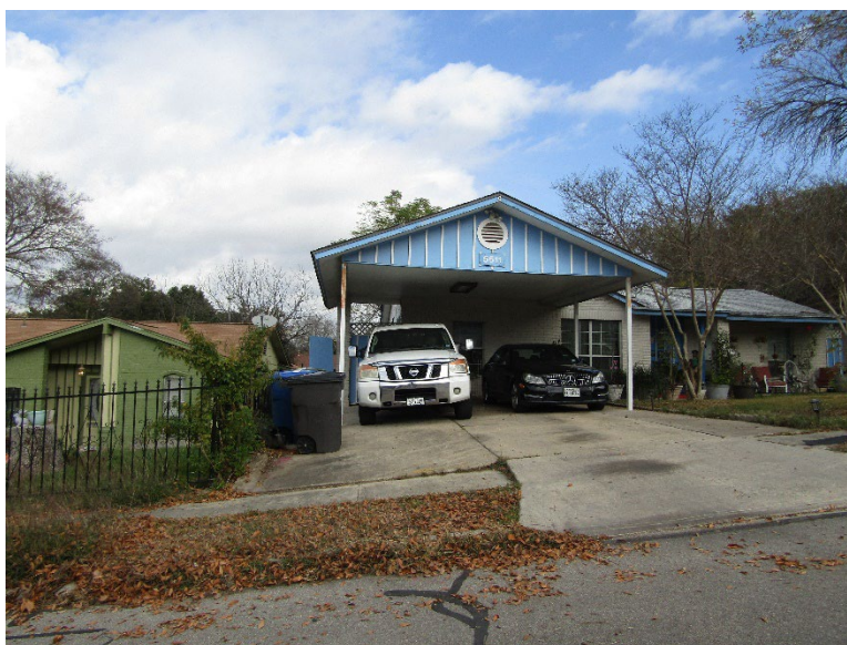
Similar Carport in Area