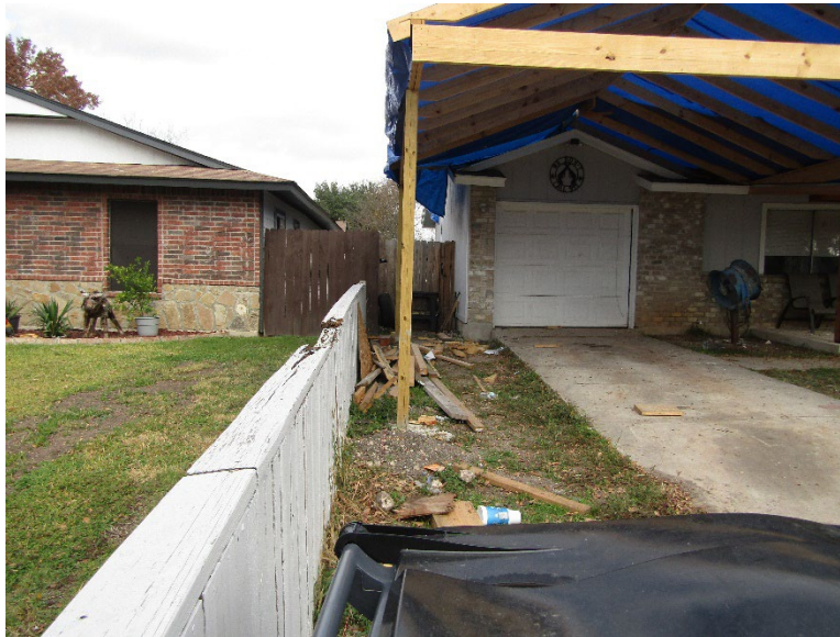
Similar Carport in Area